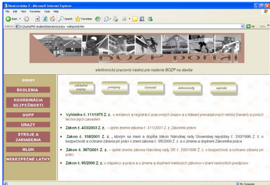
Figure 2. Content of the rubric „Legislation” within „Accidents” field