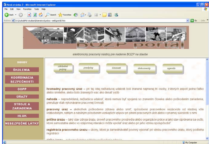
Figure 1. Content of the rubric „Terms” within „Accidents” field.

Electronic portal for occupational health and safety management on building site